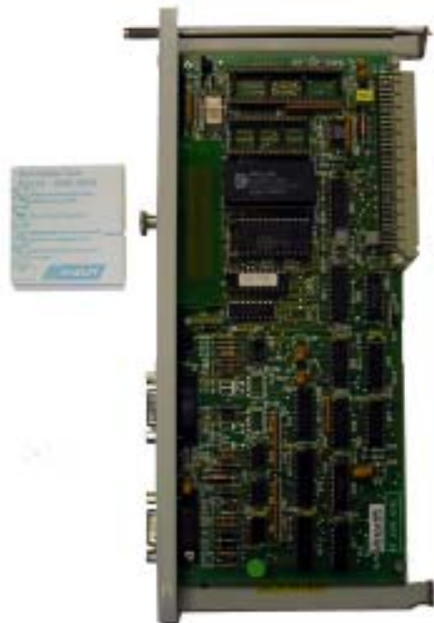
View of memory card and CPU